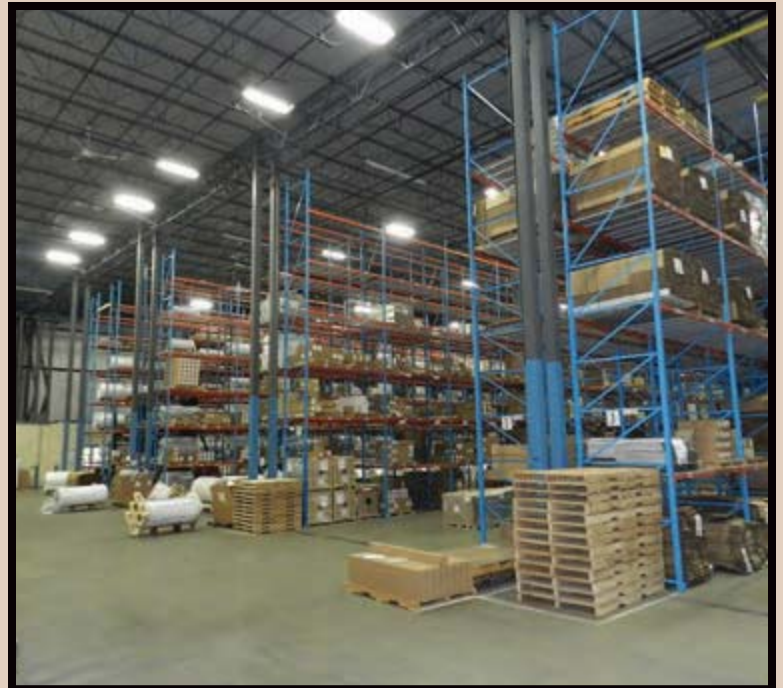
HIGH BAY WAREHOUSING

Southwest Section has (3) Armstrong humidifiers rated at a total of 100 tons; the Middle Section has (3) electronic steam Herrtronic humidifiers rated at 200 pounds of water per hour.